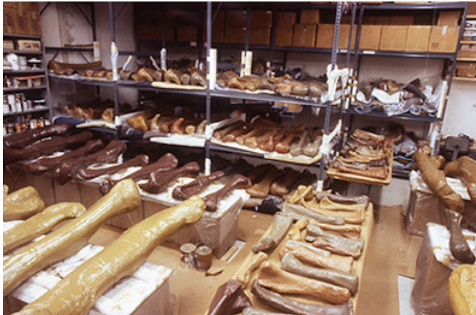
Allan McCollum. Lost Objects , 1991, during production in the artist's studio, in New York. Enamel on glass-fiber-reinforced concrete.

ers. Ultimately it is not only competing for customers with other artworks but also with all the other consumer goods.