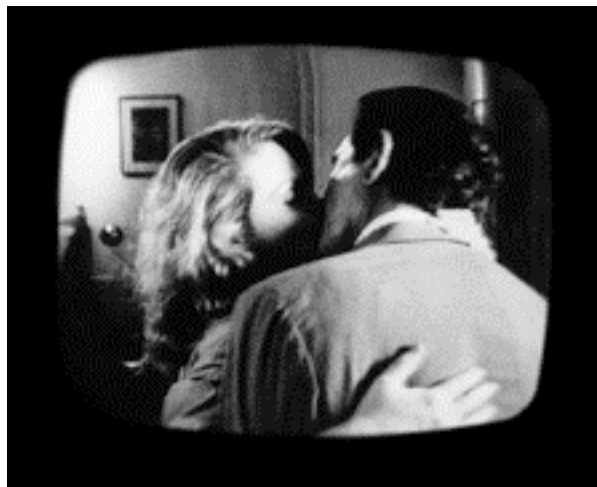
Allan McCollum. Surrogates On Location . Snapshot from television screen, 1982-84.

Offered in collections of between five and 480 objects, Allan McCollum has now sluiced his Surrogate Paintings into the art exchange by the thousands. The photograph in the lobby of the Paine Webber investment company in New York, which he has repeatedly chosen to reproduce for catalogues and articles, shows persuasively how a collection of five Surrogate Paintings has assumed the traditional role of an artwork here, now functioning as little more than a status symbol and decorative ornament over the couch. Unlike traditional paintings, the closed-off picture surfaces in