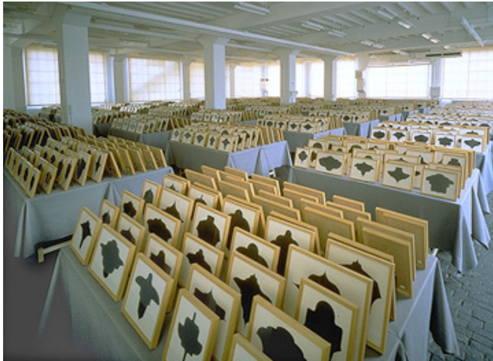
Allan McCollum. Drawings , 1989-91. Pencil on museum board, each unique. Installation: Centre d'Art Contemporain, Geneva, Switzerland, 1993.