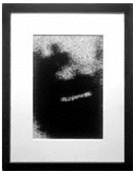
Allan McCollum. Perpetual Photo (No. 4), 1982/84. Silver gelatin print, unique.

The Perpetual Photos , developed directly from the Surrogates on Location , were first produced in 1982 but were not exhibited until two years later. They exist both as smaller prints in traditional photograph sizes, with or without mounts, as well as in larger formats, oriented to the size of paintings. Here too each work is unique. These black and white photographs have media pictures as their source, similar to the ones McCollum used for the Surrogates on Location . With the decisive difference however that the paintings reproduced in the