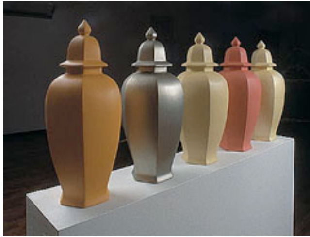
Allan McCollum. Five Perfect Vehicles , 1985. Acrylic on cast Hydrocal. 19" x 9" x 8 1/2" each.

they have acquired a somewhat relief-like surface. For these abstract creations the artist cut a total of several hundred stencils, using combinations of them for each drawing. Here too every Drawing is a unique creation, constituting just one of the innumerable possible variations.