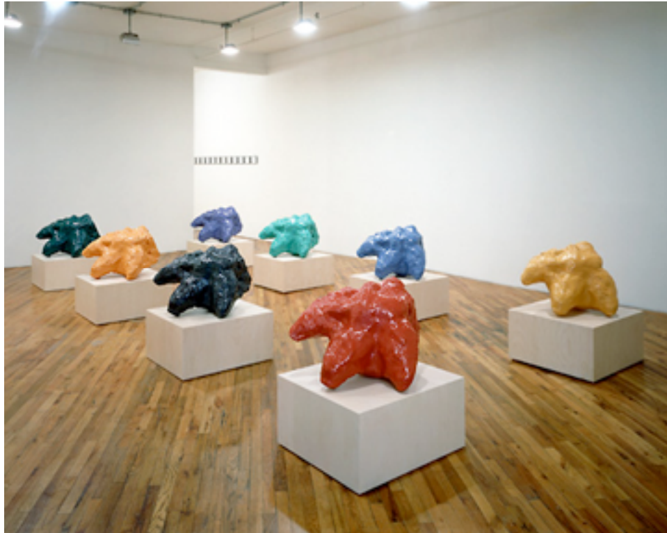
Allan McCollum. Natural Copies from the Coal Mines of Central Utah , 1994-95. Enamel paint on cast polymer-enhanced Hydrocal. Natural dinosaur track cast replicas produced in collaboration with the College of Eastern Utah Prehistoric Museum, Price, Carbon County, Utah.

appeared like his own substitute. On this occasion it is the substitute to which he ascribes the position and function of his original.