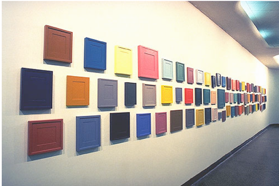
Allan McCollum. Surrogate Paintings . 1978-80. Acrylics and enamels on wood and museum board. Installation: 112 Workshop, New York, 1979.

Allan McCollum, born in Los Angeles in 1944 and resident in New York since 1975, is not concerned in his work with expanding the realm of art yet again and breaking down the boundary between art and reality (“everything is art”). Instead his approach presents him with the potential for investigating the aesthetic, emotional and psychological, social and economic conditions under which art exists within the commercial world of art. The artificial surrogates, universal signifiers which—while lacking any inherent meaning of their own—designate genres like paintings, photographs, sculpture and drawing, assume in a paradigmatic fashion all the functions that this system ascribes to them. On the other hand, McCollum the artist remains a constant fixture within this exchange