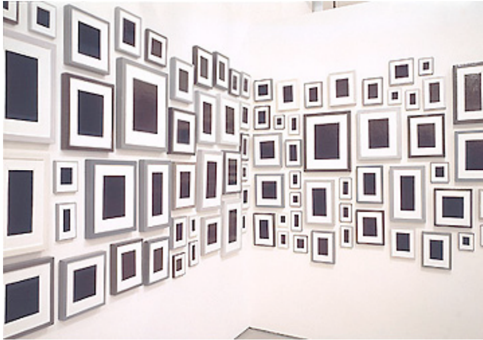
Allan McCollum. Plaster Surrogates , 1982/84. Enamel on cast Hydrostone.

art; 2) what functions does the work acquire as a result, and 3) what is its role within both the aesthetic debate and the economic system. As a model, replacement, representative, substitute or even surrogate of artwork, the Surrogate Paintings are introduced into all these different positions in the commercial art world where they not only adopt these functions in a paradigmatic way but above all illuminate the context and once again thematize its demands on art.