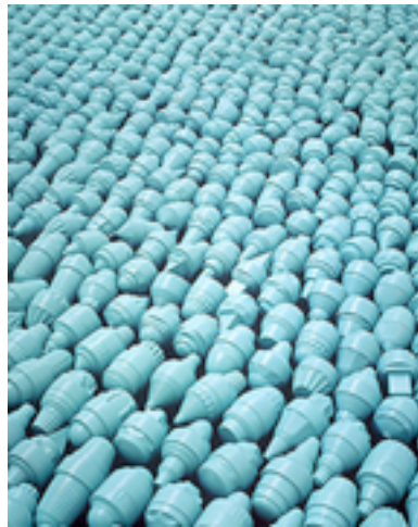
Allan McCollum. Over Ten Thousand Individual Works [detail], 1987/88. Enamel on cast Hydrocal. 2" diameter, lengths variable, each unique.

Individual Works projected on a surface, but are simultaneously substitutes for drawings.