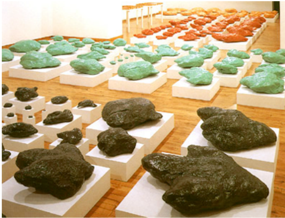
Allan McCollum. Natural Copies from the Coal Mines of Central Utah , 1994-95. Enamel paint on cast polymer-enhanced Hydrocal. Natural dinosaur track cast replicas produced in collaboration with the College of Eastern Utah Prehistoric Museum, Price, Carbon County, Utah.

sized exhibits, he began—with the help of his studio assistants—to cast eight sets of 44 plaster objects each and paint them in differing shades.