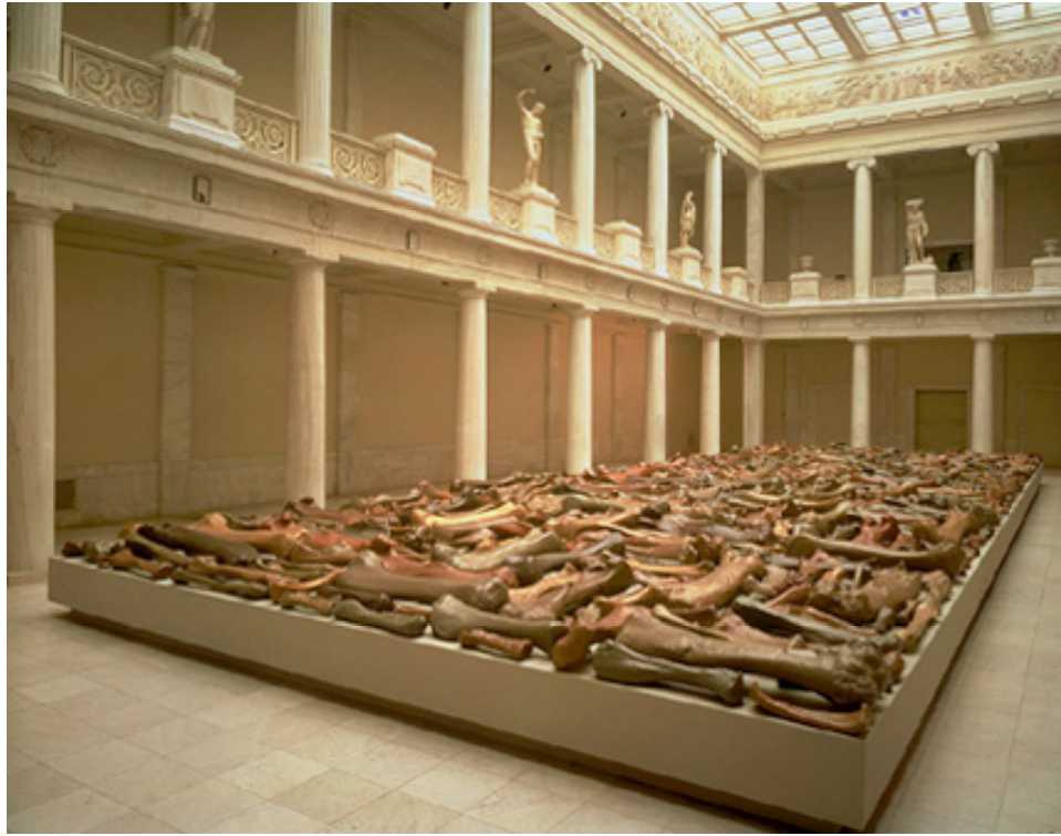
Allan McCollum. Lost Objects , 1991. Enamel on glass-fiber-reinforced concrete. Cast dinosaur bones produced in collaboration with the Carnegie Museum of Natural History, Pittsburgh, Pennsylvania. Installation: Carnegie Museum of Art, 1991.

The museum as an institution also remains a further focal point for criticism in McCollum's artistic strategy. All three figures were taken from archaeological or natural science museum collections. Consequently they are subjected to collection and presentation, and exposed to scientific and social discourse, public interests, private passions and economic restraints in a similar fashion to works of art. Allan McCollum is sustaining a line of argument here that he began in the late seventies with the first Surrogate Paintings , albeit now under different conditions. However, these new works also thematize existential experiences of separation, loss and death with a power absent in his earlier works.