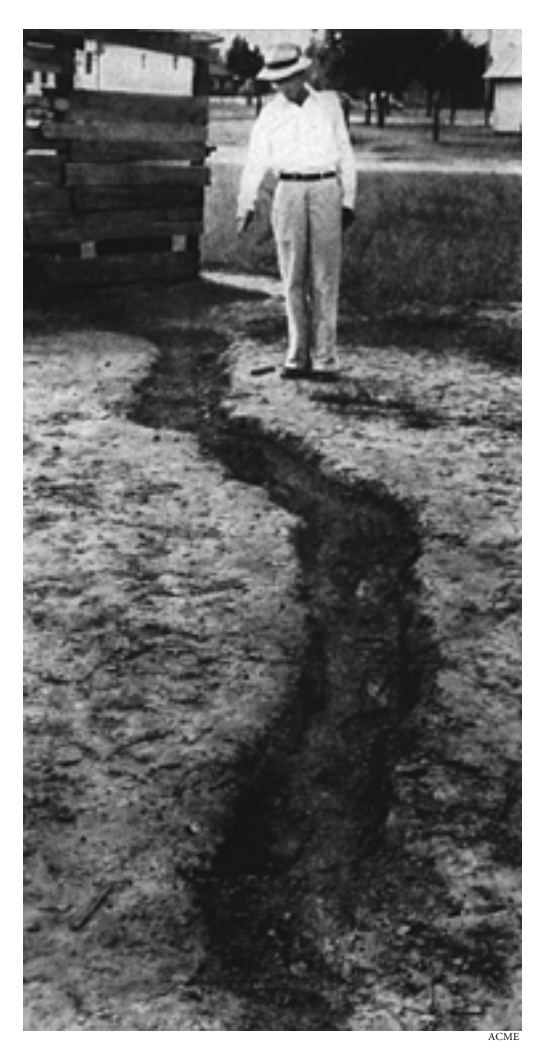
Lightning Gouged This 40-foot Trench

Three baseball players were killed when a bolt burrowed the infield during a game at Baker, Florida, in 1919. Fifty persons were injured. Ground's resistance to current "blew" the earth like a fuse.