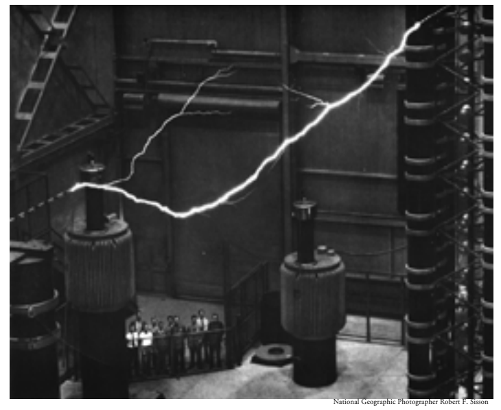
Man's Mightiest Bolt Leaps 50 Feet with Thunderous Roar

Most powerful artificial lightning ever created flashes between two generators in the General Electric Company's High Voltage Laboratory at Pittsfield, Massachusetts, with a peak energy of 15 million volts.