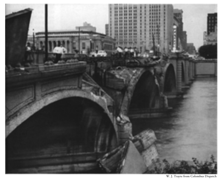
A Heavy Bomb Could Scarcely Do More Harm than the Bolt Which Struck Here Lightning is believed to have penetrated this Columbus, Ohio, bridge and caused an explosion, resulting in the damage. One person was killed; four were hurled into the river.

and that a system of lightning rods will protect buildings from damage.