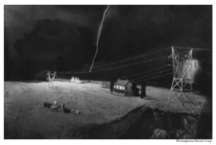
Man-made Lightning Striking a Model Powerline in a Laboratory Shows How Overhead Wires Prevent Damage

Westinghouse engineers use this miniature system for tests. Upper wires detour the three-million-volt stroke harmlessly to the ground. Lower wires, which carry the power load, are thereby protected against lightning, which might shut off the current or damage equipment. Even the cows are man-made.