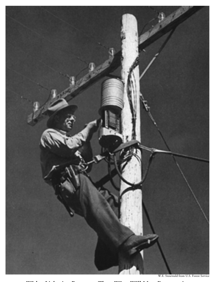
With a Lightning Protector, These Wires Will Meet Emergencies

Lightning has been known to vaporize hundreds of feet of telephone wire, leaving empty insulation. Bolts start three-fourths of the forest fires in our Northwest. This engineer checks a lightning device in Lolo National Forest, Montana. Without it, the line might be knocked out, delaying fire fighters.