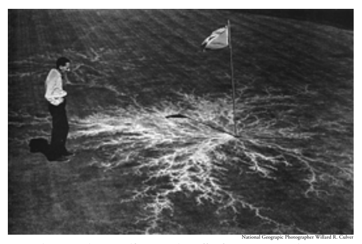
Lightning Striking a Golf Green's Flagstaff Left Its Imprint on the Grass Golf courses and other open areas are dangerous during electrical storms. This weird mark was made on the grounds ot the Chevy Chase Club near Washington, D. C.

Daring pilots participating in the "thunder storm project" operated by the U.S. Weather Bureau. Navy, and Air Force flew planes 1,363 times into the centers of thunderstorms to see what would happen. The planes were struck by lightning 20 different times, but the only damage was radio antennas burned off, small holes up to dime size drilled in wing tips, rudders, and elevators, and the head of one airspeed indicator slightly bent.