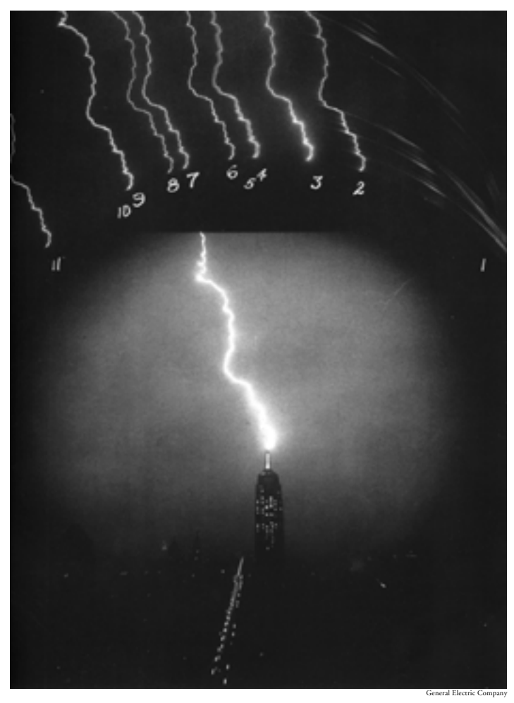
Lightning, Quicker than the Eye, Is Analyzed by the Camera. Eleven Strokes Appear as One A central lens photographs what the eye sees, A "single" bolt to New York's Empire State Building. A second lens slowly rotating around the other records the 11 (numbered) flashes which actually sped between cloud and tower. Scientists put such seemingly unimportant facts to work protecting electrical equipment.