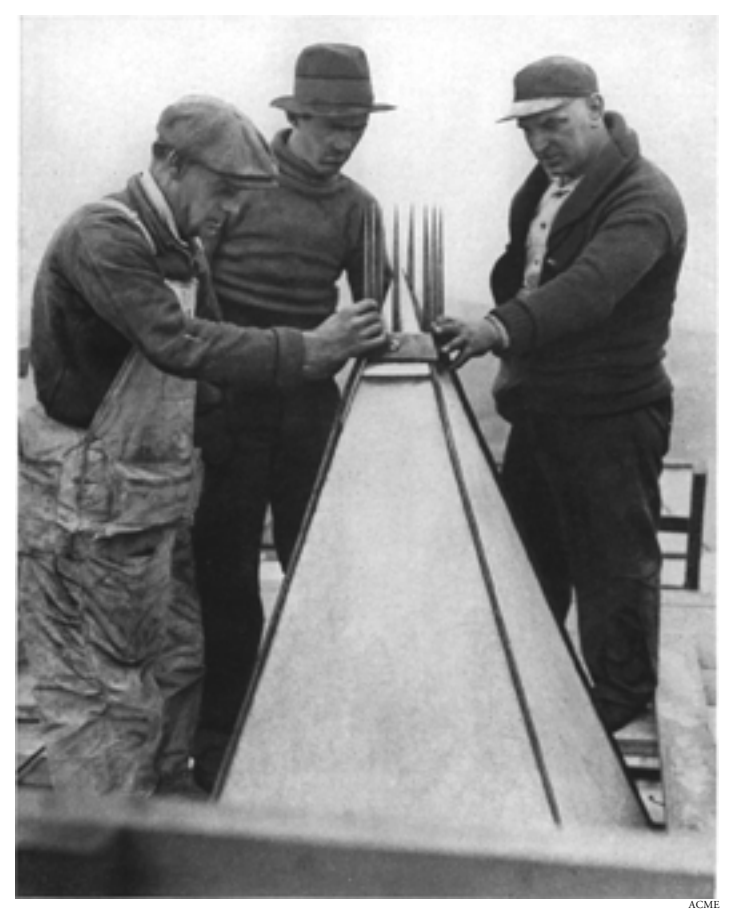
Eight Lightning Rods Guard Washington Monument's Tip

Though the Monument has been struck as many as six times in a single storm, the current flows harmlessly to earth along the rod system connected with the steel elevator shaft. As a precaution the elevator is stopped during electrical storms. These men examine noncorroding platinum points from a scaffold a few feet short of the tower's 555-foot peak.