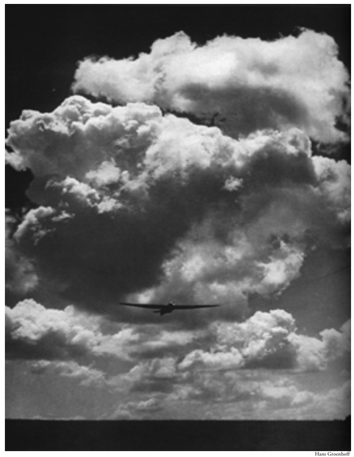
A Sailplane Pilot Sets Out to Ride a Turbulent, Drafty Elevator into the Sky

A few glider men venturing into true thunderheads have been driven upward a mile a minute and tossed like feathers. This cumulus congestus cloud promises updrafts but no lightning. The plane Screamin' Wiener, takes a tow near Elmira, New York. In Texas it set an international goal-and-return record of 229 miles.