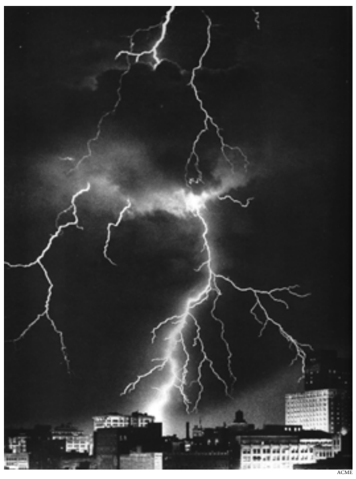
Forked Lightning, the Storm God's Grasping Fingers, Seems to Reach for Prey Lightning bolts from the sky branch out in this fashion as they grope for currents rising from the ground. Strokes from cloud to ground may be three miles long. Those from cloud to cloud 10 miles. This spectacular night display illuminates Milwaulkee, Wisconsin.

Film records showed that his airspeed indicator actually stayed at the erroneous reading of 500 miles per hour for only about 80 seconds. The radar operator in the same plane, who was not wearing dark goggles, said he was unable to read his indicator panel for about two minutes after the flash.