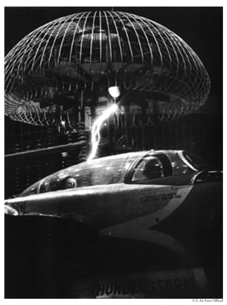
Though Lightning Strikes Within Inches, Passengers Are Safe in an All-metal Plane A test at the United States Air Force's All-Weather Flying Center, Wilmington, Ohio, shows how the plane's metal skin sheds current. In the air it might suffer holes burned in wing tips or fuselage, or a radio antenna burned away. Two passengers calmly ignore the man-made bolt.