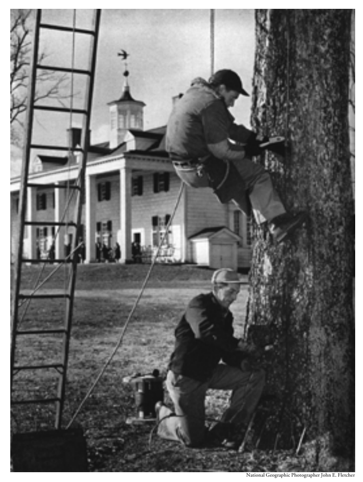
Lightning Rods Guard 23 Mount Vernon Trees, Including 10 Planted by Washington Unprotected trees are hazardous refuges in storms; they may be ripped apart when a bolt's passage forms expanding gases within the wood. Anyone caught in the open might better lie on the ground. Here a cable is installed on a 18 year-old pecan to connect rods in the foliage with others buried in the Virginia soil.

enter your body from the ground after striking the tree; or the tree may explode, injuring you by flying fragments. Don't go near wire fences, or other wires. Lightning may travel long distances along barbed-wire fences, far from the place where it originally struck. Livestock often is killed this way.