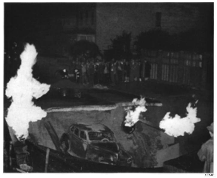
Mains Broke, Gas Burned, and a Car Fell into the Subway When a Bolt Struck in Brooklyn Gas lines under the street were supported by temporary decking. When lightning smashed the props, pipes collapsed and gas caught fire. Gas in tanks or subsurface mains cannot be exploded by lightning.

Lightning strokes between a cloud and the ground may be three miles long or more. Between two clouds they may flash over a distance up to 10 miles. Lightning travels 20,000 miles a second.