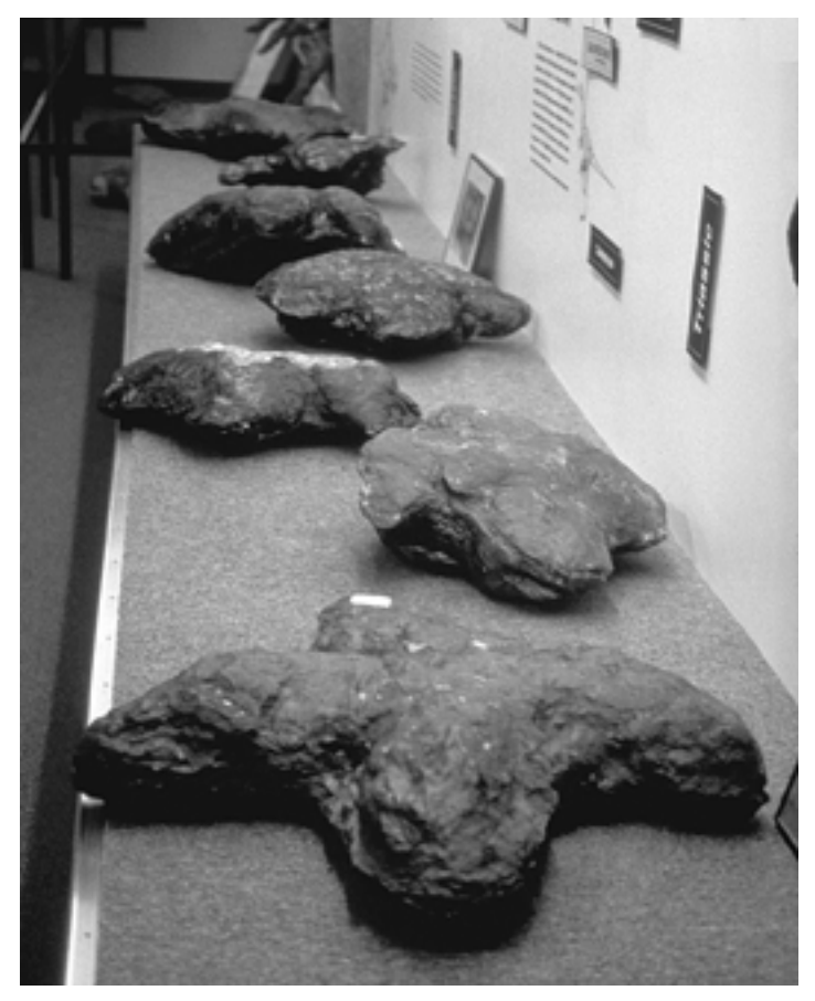
Natural casts of dinosaur footprints, chiseled down from the roofs of Utah coal mines. Collection of the College of Eastern Utah Prehistoric Museum, City of Price, Carbon County, Utah.

to the museum, and they sometimes need to lay people off, which they don't like to do, so I paid them to keep their two preparators working for three extra months or so. That was really their main reason for letting me do it, I suspect. We both helped each other. I think they also really loved the idea that somebody was interested in these things and that might have been a little guilt on their part because they weren't really so interested in them, scientifically.