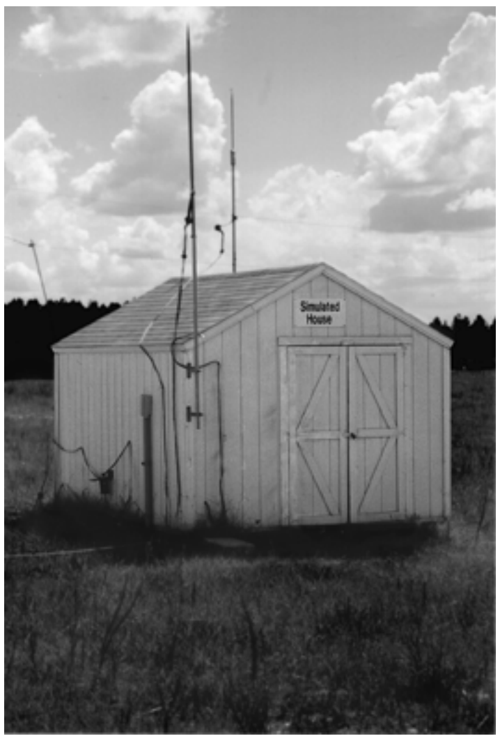
The lightning research center's Simulated House, the 'Sim House,' used as a target for triggered lightning research.

ment and wiring around, and so forth. There was no way they could measure the charge of the lightning in my 'experiment.'