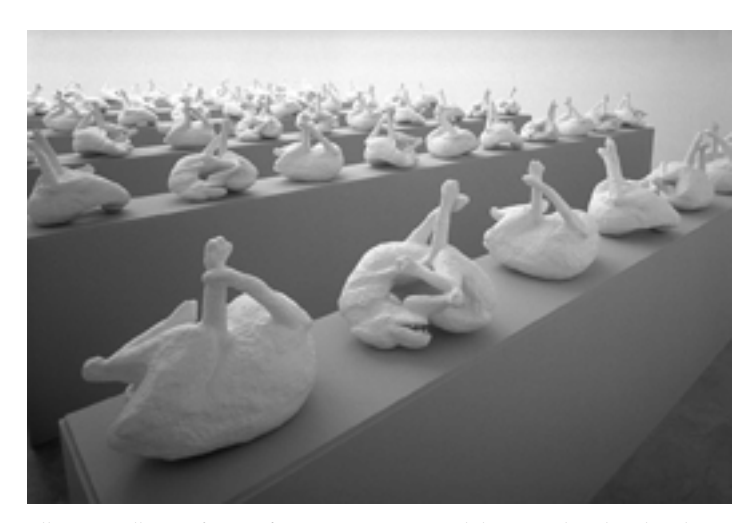
Allan McCollum. The Dog from Pompeii. 1991. Solid cast Hydrocal with polymer reinforcement.

AM: Of course, artworks are rooted and conditioned in a lot of other terms. They don't just emerge from anywhere as ideal objects into some ideal space in a museum somewhere.