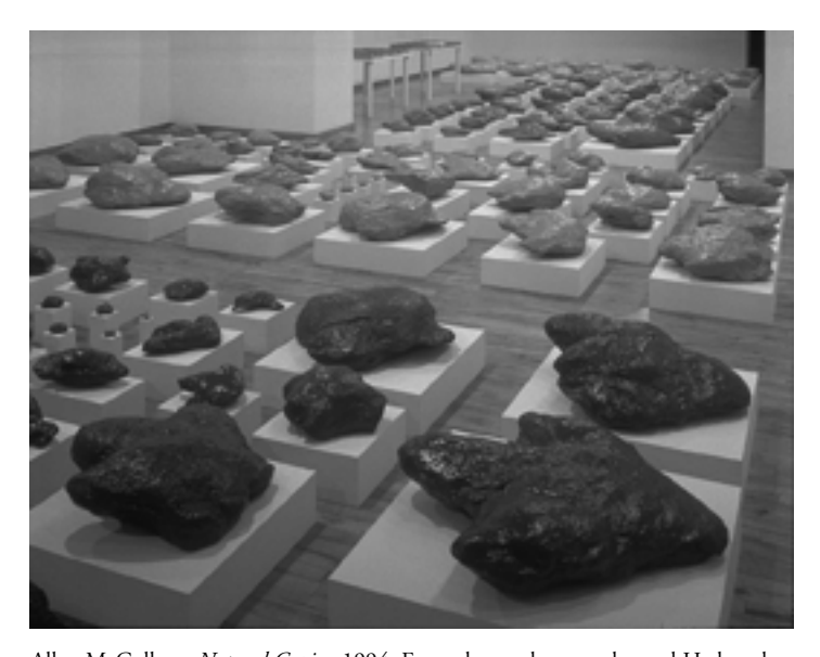
Allan McCollum. Natural Copies. 1994. Enamel on polymer-enhanced Hydrocal.

AM: I tried to create didactic handouts that went with the exhibit because I wanted to imbue my art exhibit with the feeling of it being an educational project and as a part of an object that had meaning in the community of Price, Utah. I couldn't get their educational department interested in participating in this, so I did it all myself and I worked really hard and edited 21 different historical texts on dinosaur tracks found in coal mines and so on, with pictures. I printed them out on my laser printer and they looked pretty nice. They were all different colors, and they are used as didactic handouts whenever I show