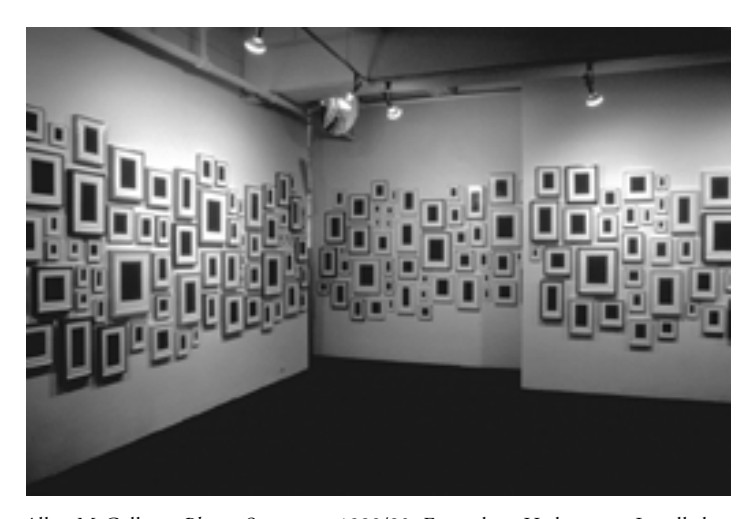
Allan McCollum. Plaster Surrogates . 1982/83. Enamel on Hydrostone. Installed at Marian Goodman Gallery.

'identity' of an artwork. I am interested in how we determine what is an artwork and what isn't an artwork, and how we determine what could be an artwork. I've thought about what feelings we have when looking at an artwork as compared with how we feel when we look at other kinds of objects, and so on. I've been trying to explore what kind of objects art objects are, and why some objects are more magical and expensive than others, and what aspects of our culture have created this system where things can become more valuable or less valuable depending on certain, sometimes seemingly unexpected conditions. For many years, since 1978, I worked on a series of paintings called the Surrogate Paintings , and the Plaster Surrogates ,