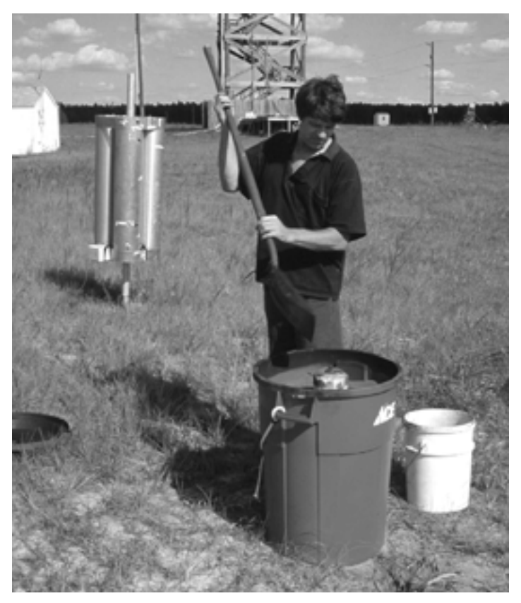
The rocket and the sand-filed receptacle used in McCollum's lightning-triggering experiment to create the fulgurite.

JD: It's difficult to abandon what you know, or have learned – to change habits or procedures.