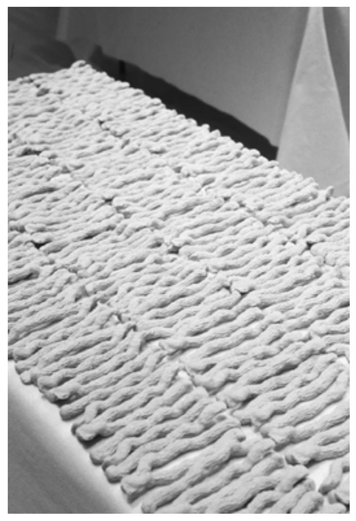
The Event: Petrified Lightning from Central Florida, by Allan McCollum, installed at the University of South Florida Contemporary Art Museum. Detail.

Creations.' They came up with a reasonable quote, and it seemed feasible that the project could be done this way. It also seemed to become more interesting if I could ask them to make the fulgurites out of the exact sand that the original artifact had been created in. So