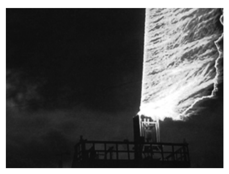
Lightning triggered by a small rocket strikes the launch tower at the Lightning Research facility at camp blanding. The research center is not only involved in academic research, it also studies how lightning affects underground pipes, power lines, electrical equipment, golf course shelters, airport runway lights, and other systems.

JD: Okay, maybe you could talk too about that number, 10,000+ copies.