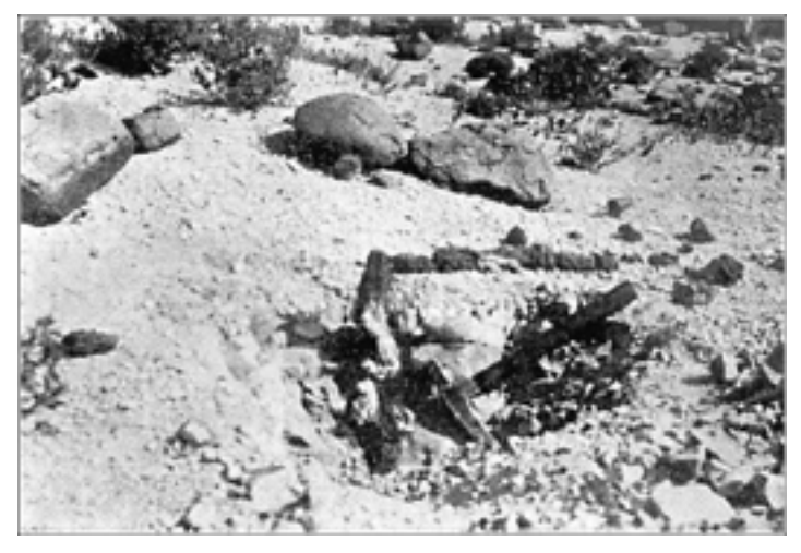
Figure 2: A Manganese fulgurite, partly exposed. Chugwater Creek, Wyoming.